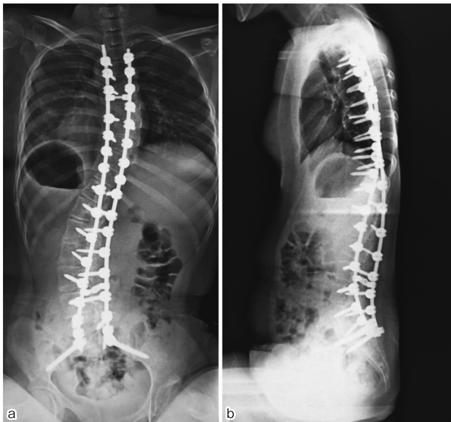
Figure 3. Radiographs at 1.5 years after surgery. She is able to sit by herself. Her digestion and defecation have improved.

scoliosis was associated with a high rate of postoperative complications. However, it had a high rate of caregiver satisfaction. The medical team caring for HC should be aware of the risks and benefits associated with scoliosis surgery.