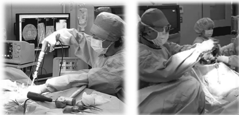
Figure 1. Using a power tool (left) and a manual driver (right).

Elliott et al. performed a study on the use of power tools versus hand tools for the bones of the extremities and found that power tools reduced the time required to insert cortical